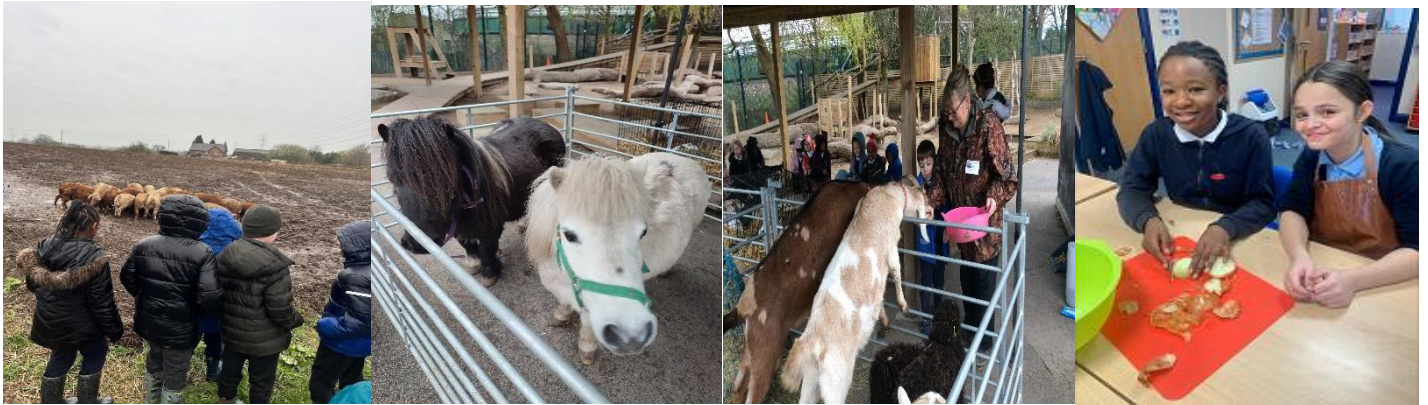
History - WWII