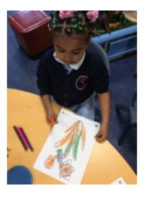
Watering their planted seeds. Easter colouring.