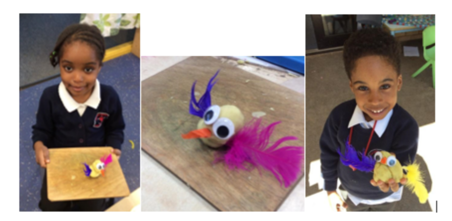
Easter chicks with play dough.